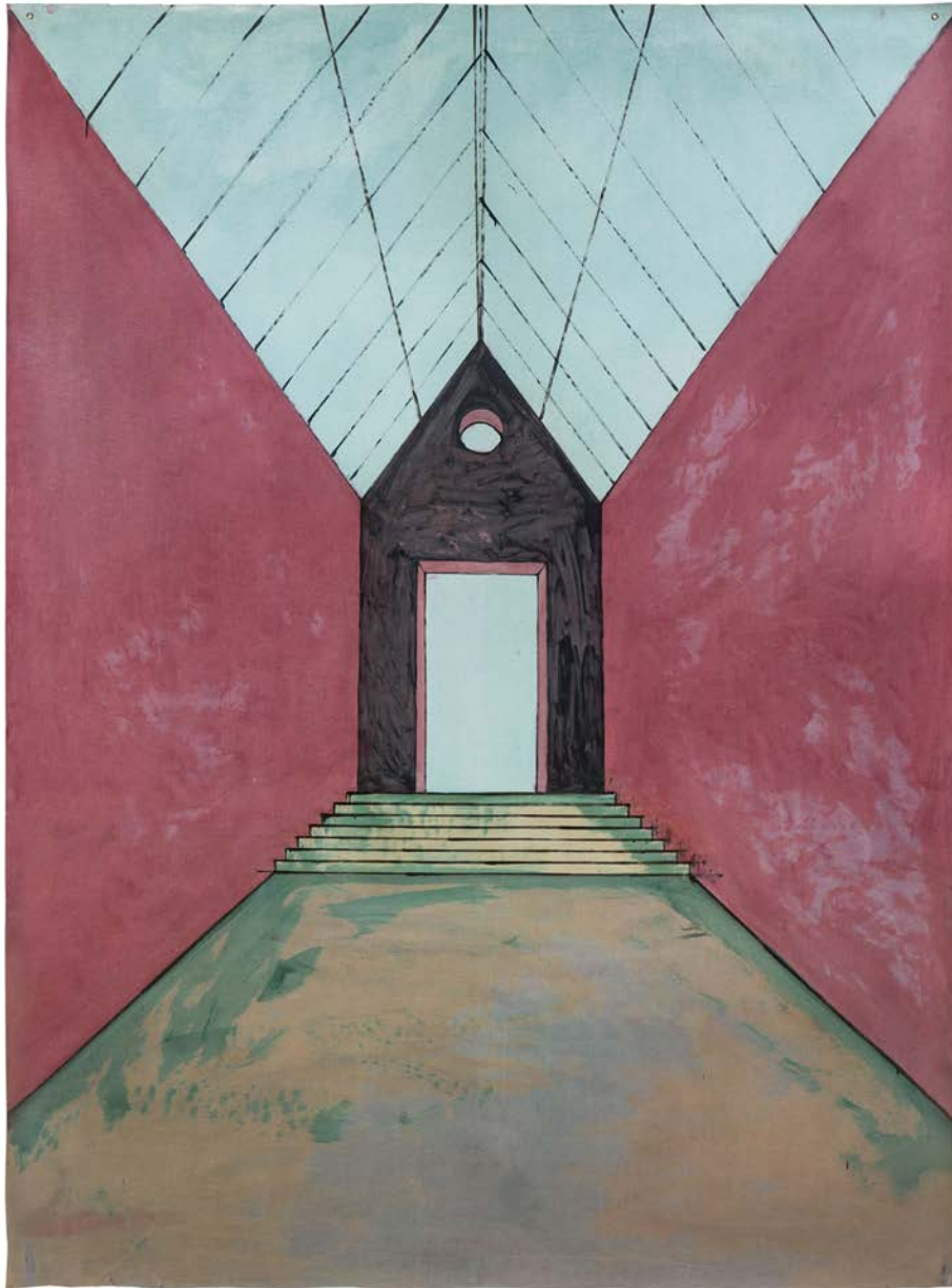
Thomas Schütte, Untitled (Die Burg) , 1984, lacquer on paper, 86 5/8 x 63 inches