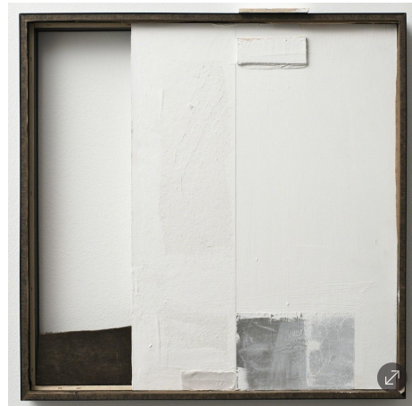
Untitled , 2013 Alison Jacques Gallery