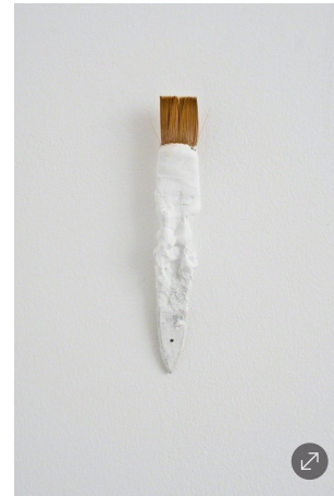
Untitled , 2013 TWO x TWO