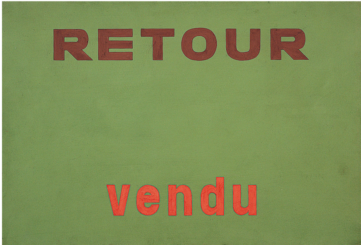
Retour vendu (1958).

My second encounter with the work of Franz Erhard Walther took place in the '90s, when I was asked to write a catalogue essay for a museum exhibition of the artist's work ["Franz Erhard Walther – Work Needs the Body: A Strong Misreading" in Franz Erhard Walther – Ich bin die Skulptur , Kunstverein Hannover, Germany, 1998]. Re-examining the work, or rather the photos of the work, it seemed to me reflective of the ideas of Michel Foucault about the regulation and control – what Foucault called the discipline – of bodies. It was Walther's sculptural expression of this regulation of bodies that impressed me. The power of the work, I wrote, "comes from the fact that he does not simply picture or describe bodies in this regulated geometric space. Rather he asks himself and others to themselves experience this space, like pilgrims retracing the Stations of the Cross." I viewed Walther's human actors as subjected to the author's rigid control of space, as denied any vestiges of their individuality, as mere cogs in the construction of an abstract geometric order fashioned "of only two materials, the warm living body and the soft limp cloth." I saw the very non-referential quality of Walther's pieces as intensifying this Foucauldian narrative. Here, the discipline of bodies served no practical worldly goal – the performers were solely enacting a purified aesthetic of controlled bodies in space.