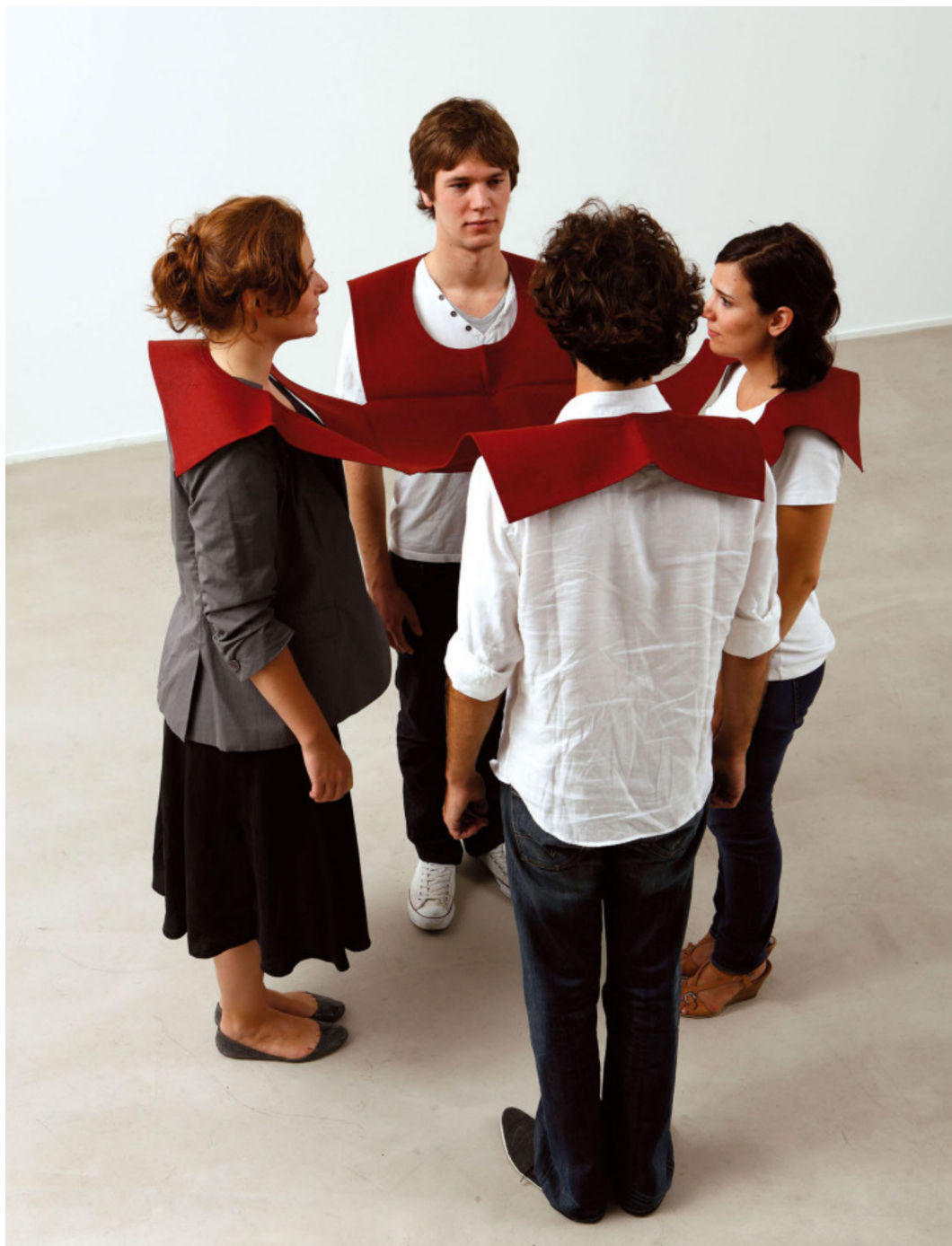
Kreuz Verbindungsform. (Nr.36, 1.Werksatz) (1967).