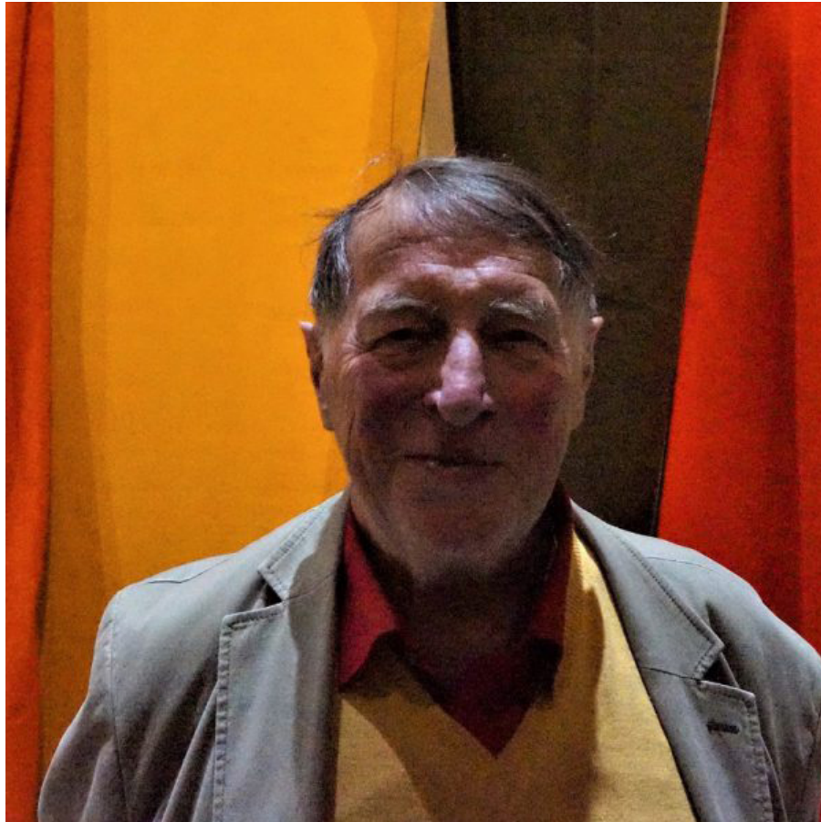
Franz Erhard Walther

front of one of the artworks. As it turned out he was the artist. He was also asking the staff to correct some minor installation issues between being photographed. I decided to interrupt to compliment him on his artwork, I also asked if I could take his picture, he was very polite, thanked me for my comments and obliged with a big smile. What I hadn't realised was that he was about to be honoured as the recipient of the Golden Lion for best Artist at the Biennale, hence the photo shoot. A much-deserved artist.