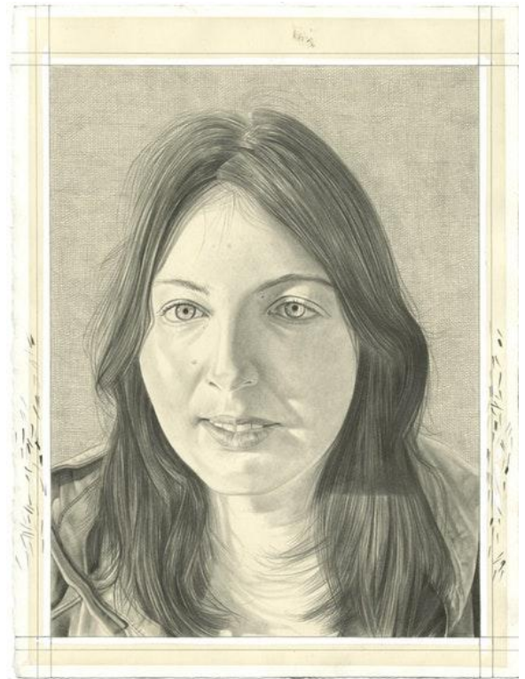
Portrait of the artist. Pencil on paper by Phong Bui.