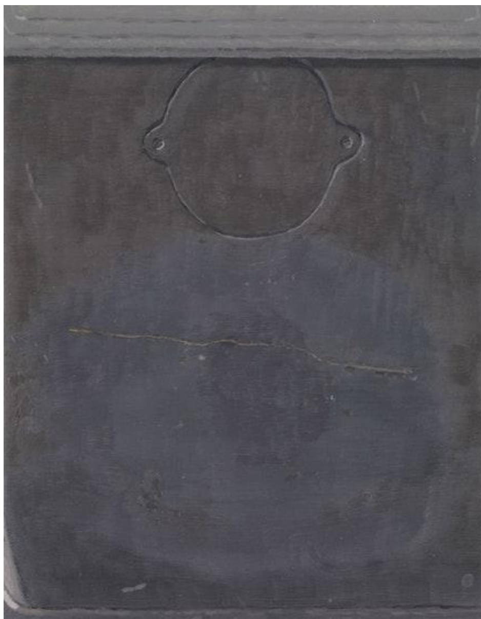
"Cracked Back," 2011. Oil on linen, 18 x 14".

place on the west coast where it wasn't raining. It was a 12-hour drive away, so I packed up the car and drove there, staying in a dusty RV park. This is a very remote area. And just by wandering around, I discovered there's this whole history of mining there. And then I met a man who wrote a book about the history of the town—just extraordinary. I eventually found this abandoned silver and lead mining site about 12 miles outside of town on the face of a mountain. At the site I found this huge, two-ton probably, diesel compressor, which used to power all the equipment at the site, and someone had tipped it over and spray-painted the word "Shame" on it. It was one of the best objects I've ever seen: It had language, time, and mechanics—all the stuff I'm interested in. So of course I tried to paint it, but the wind, which was at least 50 miles per hour, broke my easel, destroyed the painting. I ended up having to paint out of the back of my car, and that's when I did "Mine Site" (2011). But I kept thinking, "Well, I'll just go back after the heat of the summer and do the painting of the compressor then." So it was early October, just last month, the last possible week I could go when it would be cool enough so my paint didn't melt, but also before my show opened. Peter came with me, we flew to Las Vegas, rented a car, drove two hours to