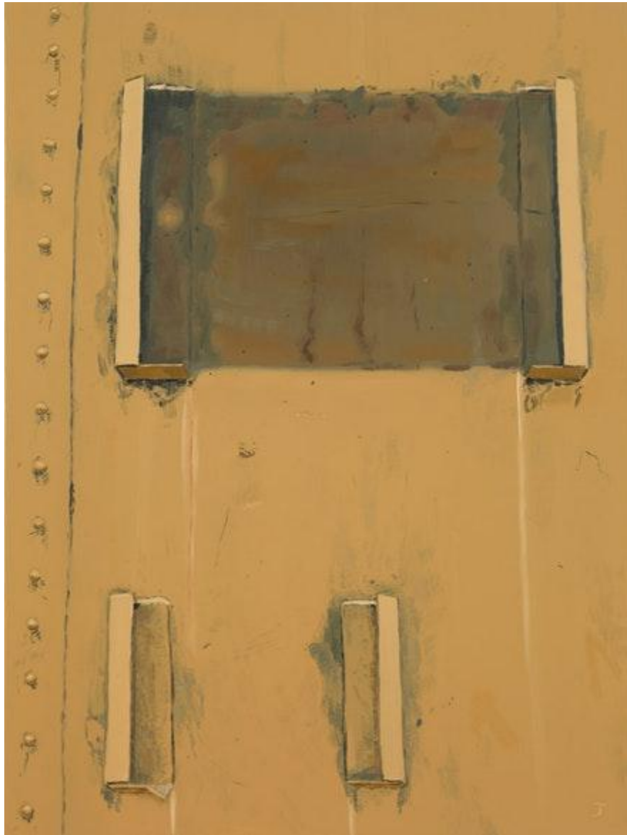
"Sign Holders," 2010. Oil on linen. 40 x 30".