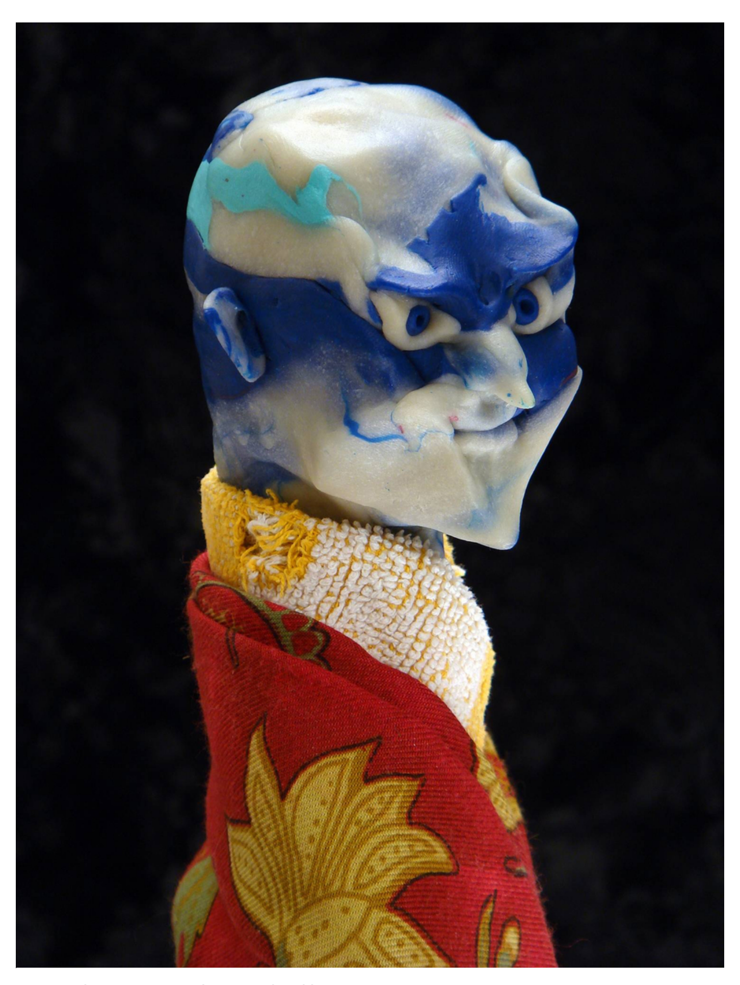
Thomas Schütte Bert. Photo: Gino Bühler © DACS 2012