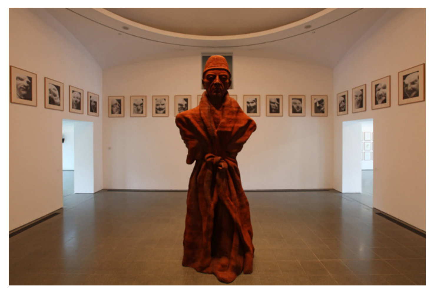
Thomas Schütte Vater Staat (Father State) 2010 Installation view, Thomas Schütte: Faces & Figures Serpentine Gallery, London (25 September - 18 November 2012)

Thomas Schutte: Faces & Figures is on display in the Serpentine Gallery, Kensington Gardens until 18 November. Admission is free.