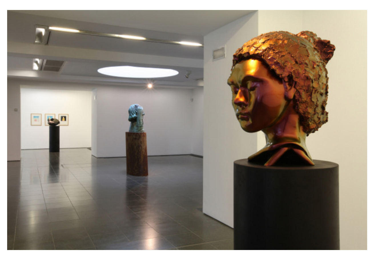
Thomas Schütte Walser's wife 2011 Installation view, Thomas Schütte: Faces & Figures Serpentine Gallery, London (25 September - 18 November 2012)