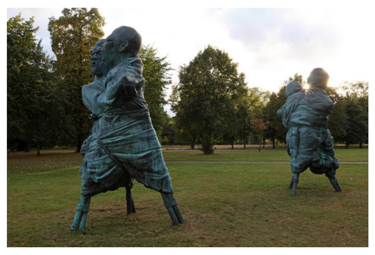
Thomas Schütte United enemies 2011 InInstallation view, Thomas Schütte: Faces & Figures Serpentine Gallery, London (25 September - 18 November 2012)