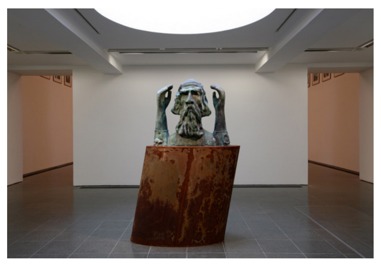
Thomas Schütte Memorial for unknown artist 2011 Installation view, Thomas Schütte: Faces & Figures Serpentine Gallery, London (25 September - 18 November 2012)

The term 'one of the world's most influential living artists' is bandied around far too gratuitously in our opinion, and it's been used in the press release for Thomas Schutte's latest exhibition examining portraiture through various media. So do his latest works live up to the hype?