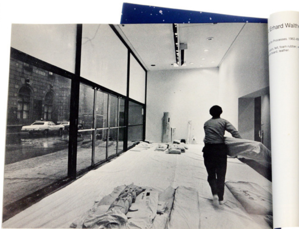
Franz Erhard Walther arranging the sculpture for the Museum of Modern Art's "Spaces" exhibition in 1970: the floor-to-ceiling windows allowed pedestrians to observe as visitors participated.

In a sense Mr. Walther has spent his career putting his own quiet, ego-free stamp on Beuys's notion of "social sculpture." His canvas pieces resemble L. L. Bean products gone awry: abbreviated, detail-free fire hoses, sleeping bags, collapsible bus shelters or tents, life vests, backpacks. They are simply meant to be held, worn, lain in or stood under, usually by two or more people, creating strange moments of social intimacy and spatial awareness.